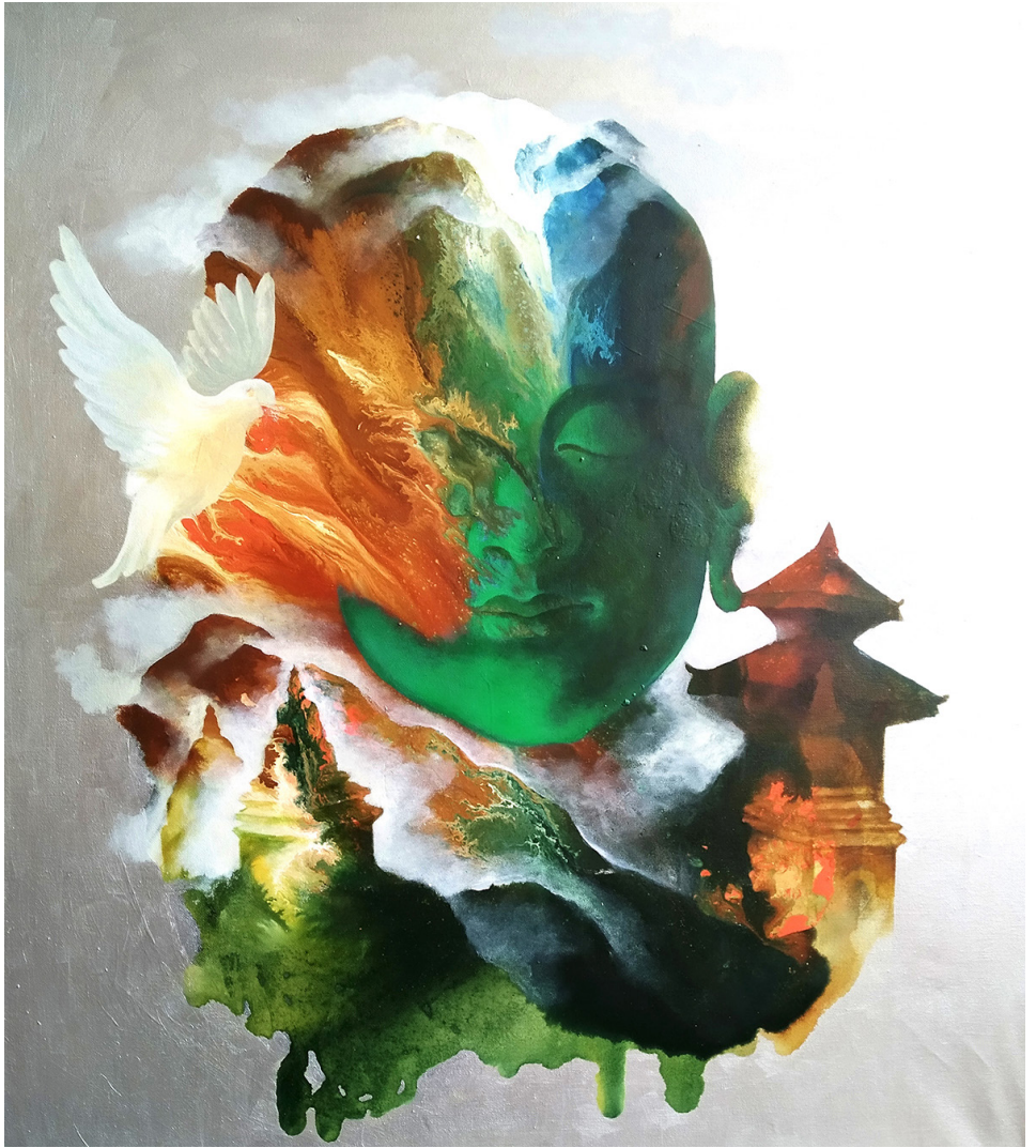
Melting Heritage Gate, (91x122 cm) Acrylic on canvas 2017