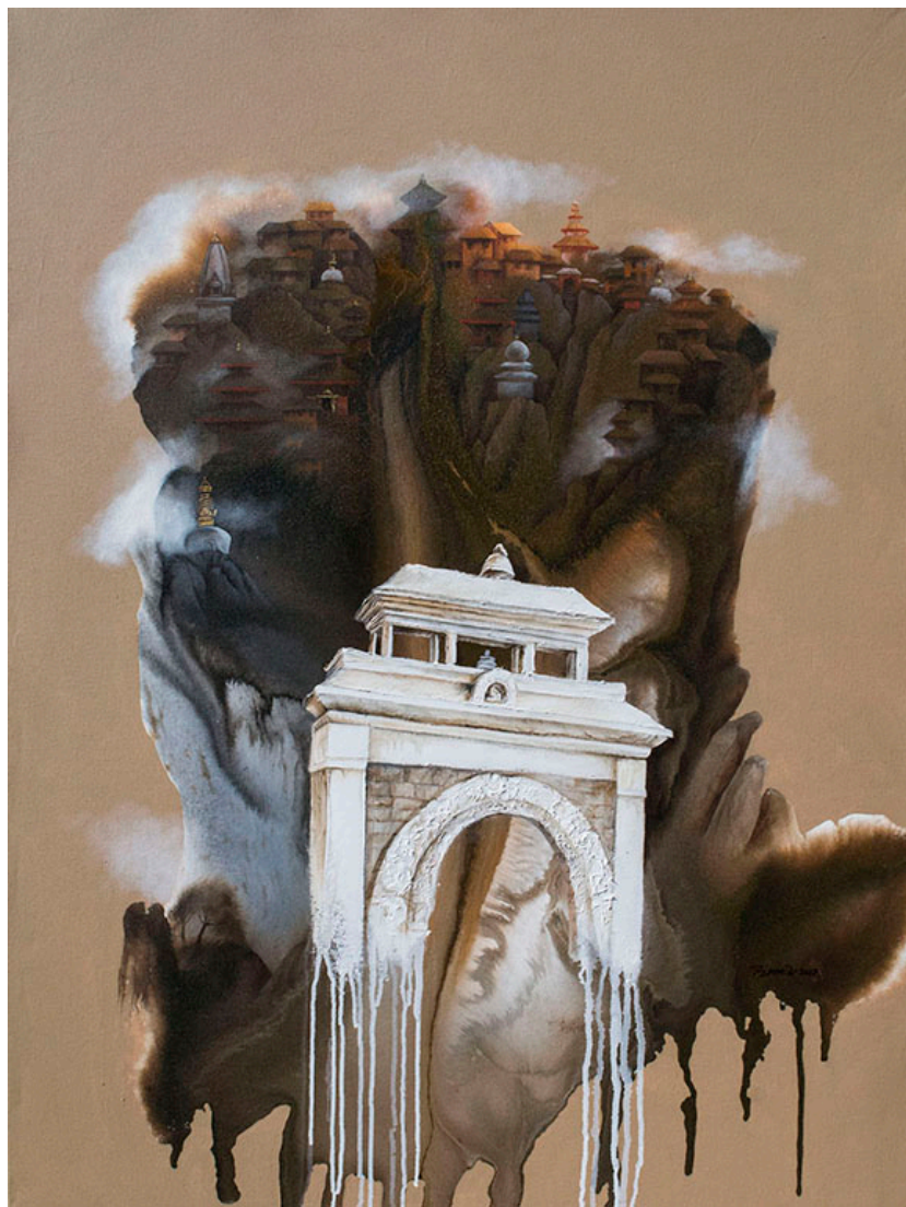
Melting Heritage Gate, (91x122 cm) Acrylic on canvas 2017