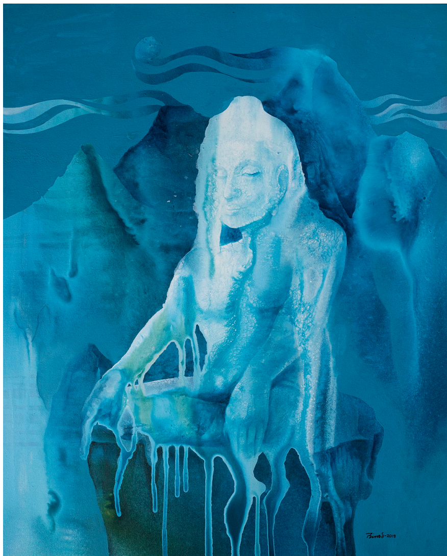
Melting Heritage Gate, (91x122 cm) Acrylic on canvas 2017