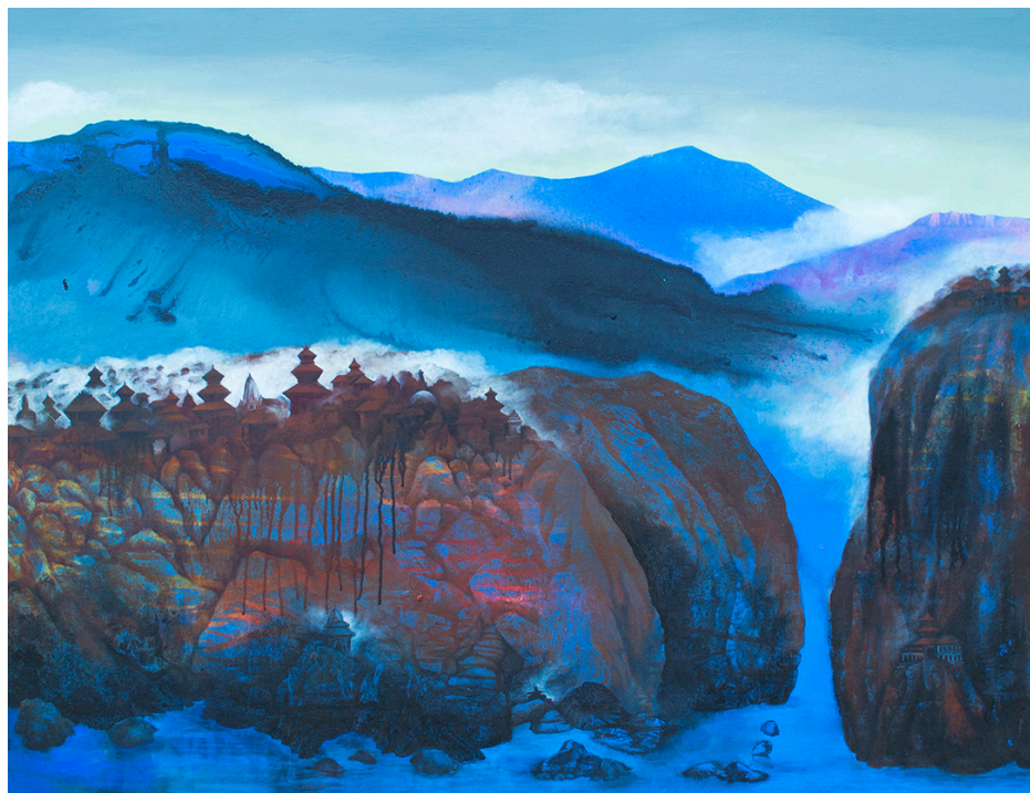
Melting Heritage Gate, (91x122 cm) Acrylic on canvas 2017