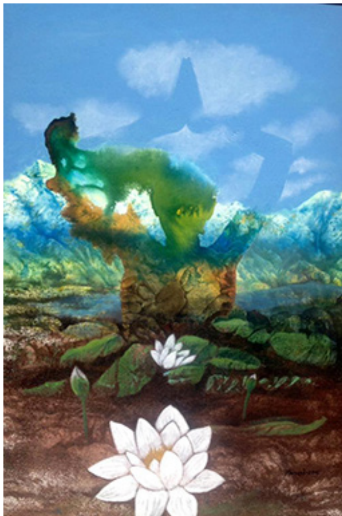
Melting Heritage Gate, (91x122 cm) Acrylic on canvas 2017