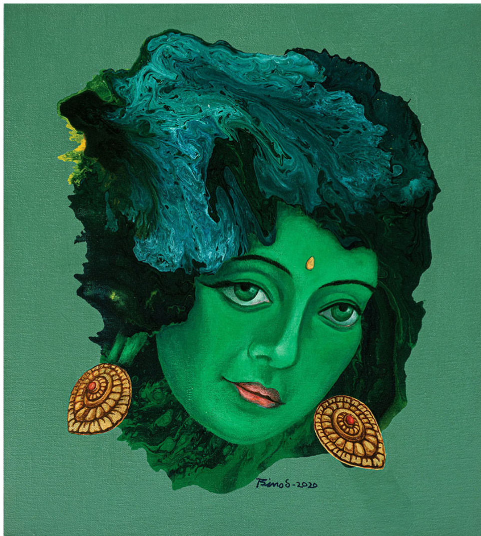
Melting Heritage Gate, (91x122 cm) Acrylic on canvas 2017