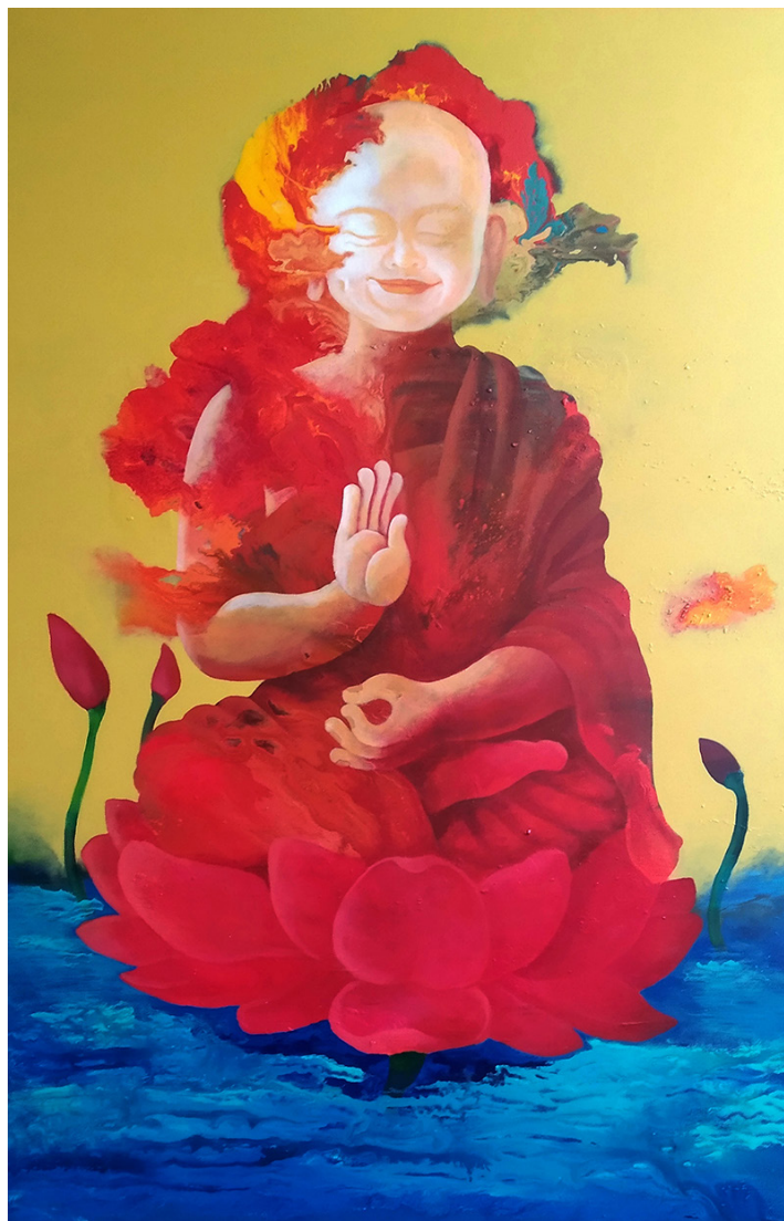
Melting Heritage Gate, (91x122 cm) Acrylic on canvas 2017