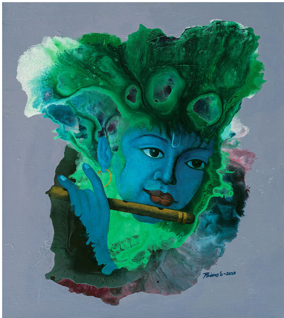
Melting Heritage Gate, (91x122 cm) Acrylic on canvas 2017