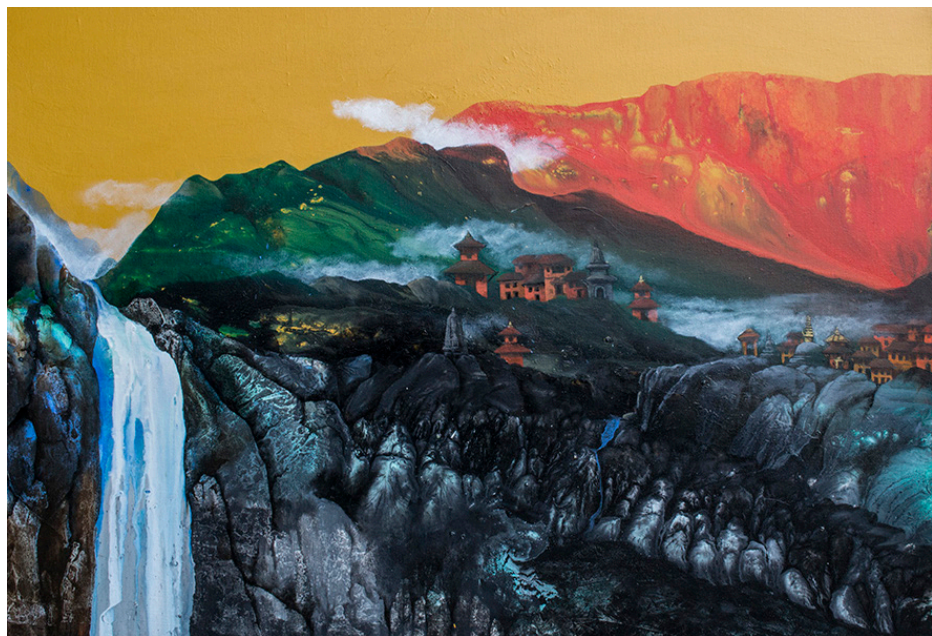
Melting Heritage Gate, (91x122 cm) Acrylic on canvas 2017