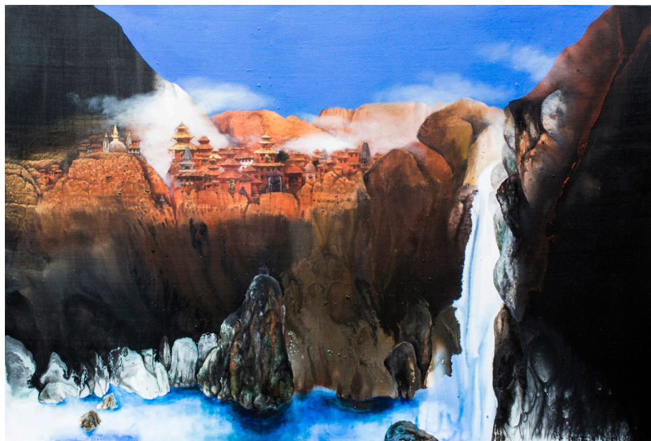
Melting Heritage Gate, (91x122 cm) Acrylic on canvas 2017