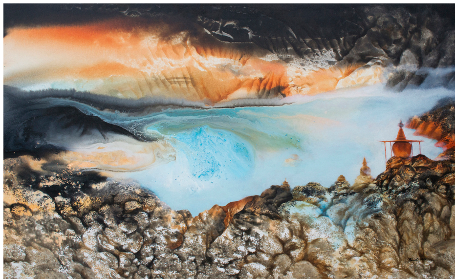
Melting Heritage Gate, (91x122 cm) Acrylic on canvas 2017