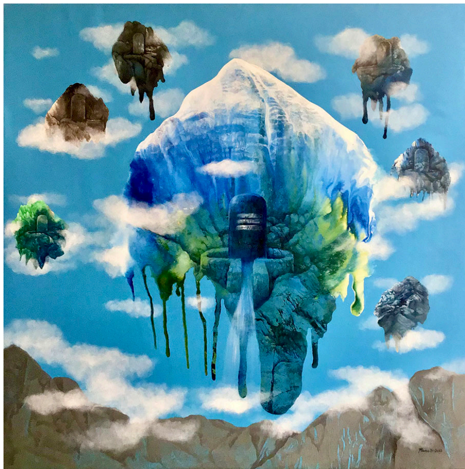
Melting Heritage Gate, (91x122 cm) Acrylic on canvas 2017