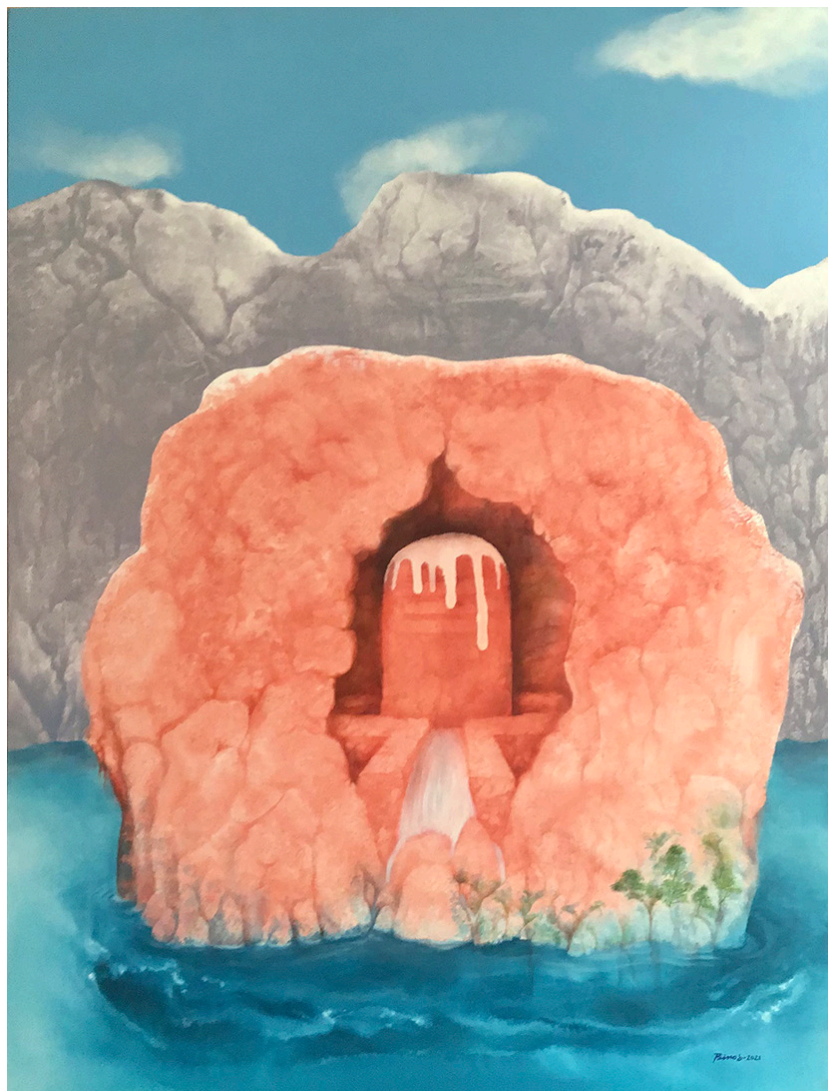
Melting Heritage Gate, (91x122 cm) Acrylic on canvas 2017