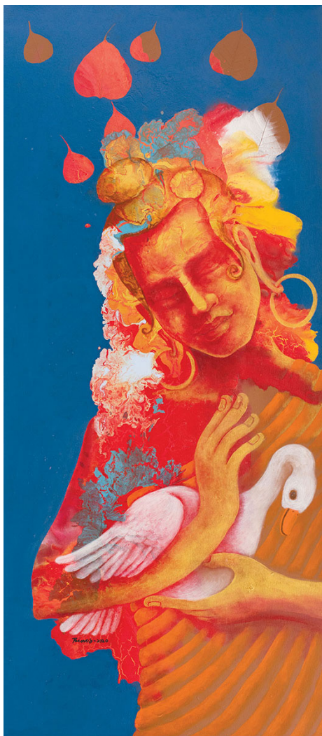
Melting Heritage Gate, (91x122 cm) Acrylic on canvas 2017