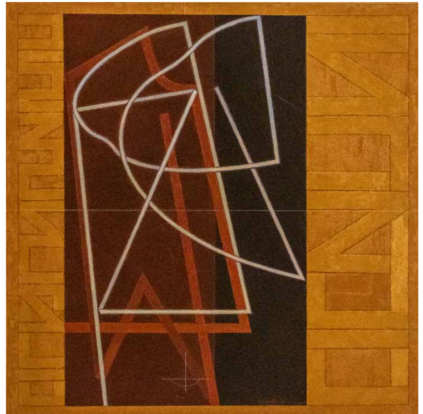
For Nepal Acrylic on Rice Paper & Canvas 36 x 36 inches

Primarily a printmaker, Palaniappan started making drawings and acrylic paintings later on. He is also a photographer and has worked with digital and computer imagery.