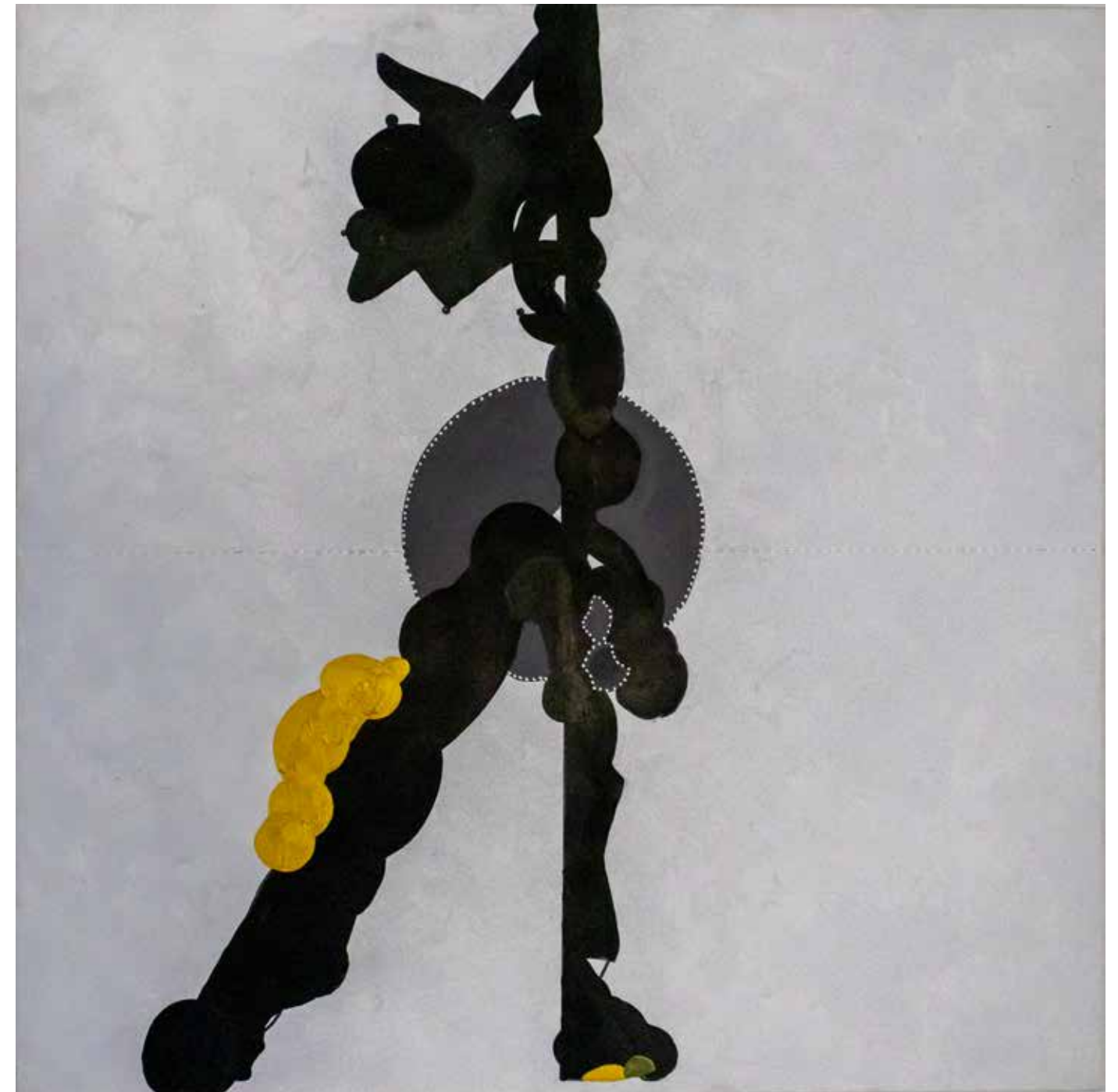
Untitled Acrylic on Canvas 36 x 36 inches

Amitava Das was born in New Delhi in 1947 and graduated from the Delhi College of Art in 1972. His work is primarily based on human situations, where man is both the creator and the destroyer. The natural and artificial are cleverly fused to show the interdependence of the man-made and natural worlds. He tries to bring out the inner struggles of men placed in difficult times.