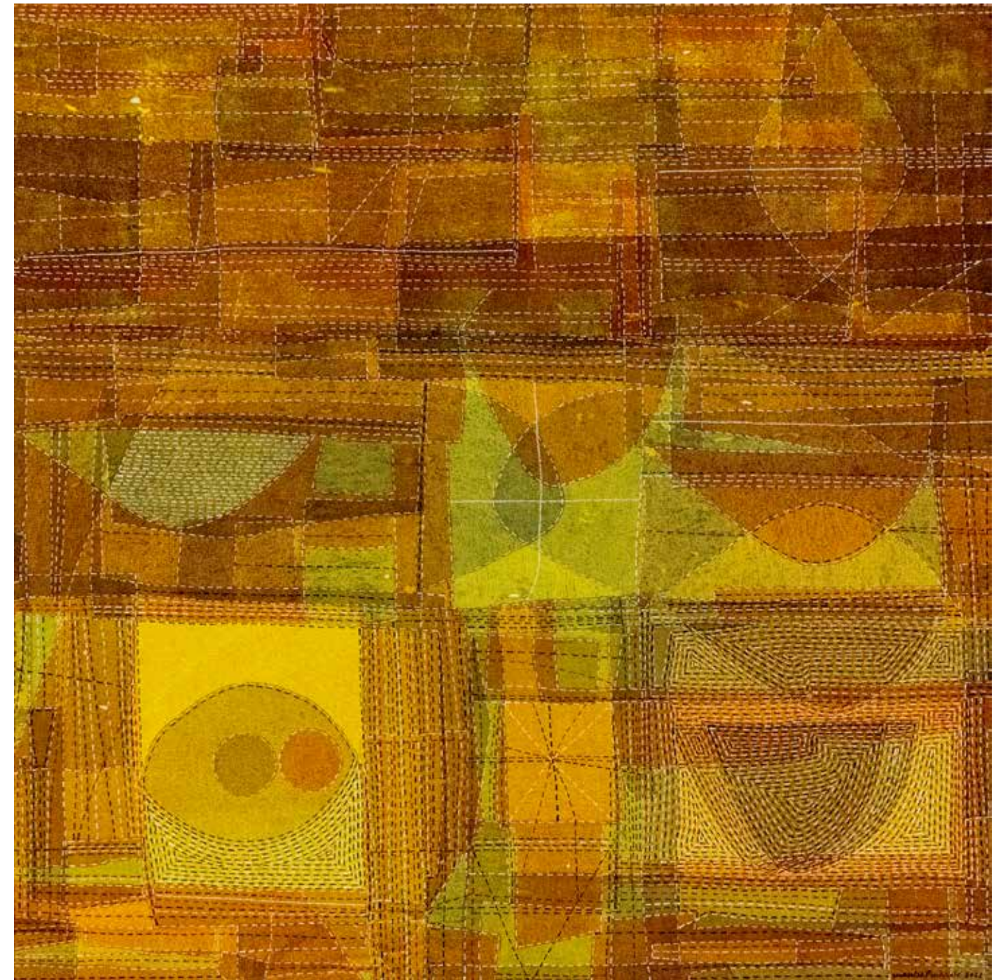
Nepalese Diary Acrylic on Canvas 36 x 36 inches

Pushkale's art is intrinsically linked with the mythological, without making overt references to the same. A subdued color palette lends a lingering calm to his works. However, on a closer examination, the motifs and symbols in his art come to light, giving it different meanings. Subtle brush strokes and shading create multi-layered meaning.